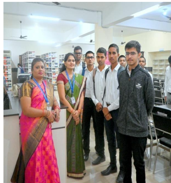
Visit To Library