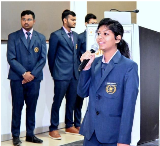
Students 2021 batch