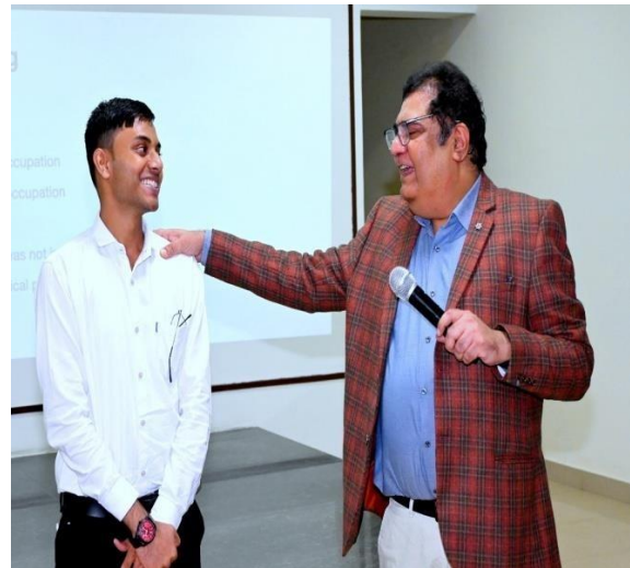
Student 2022 batch