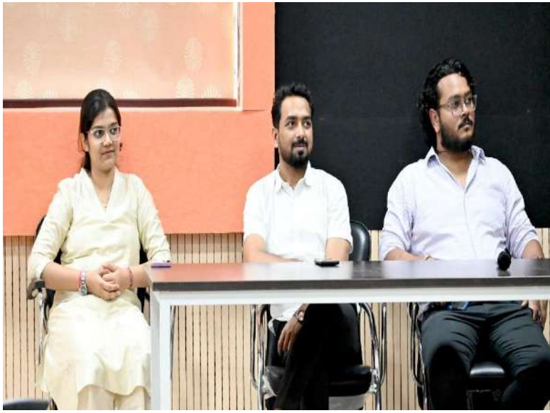
HALL CO -ORDINATORS