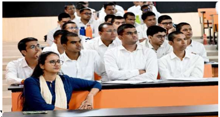
COMMUNITY HEALTH CENTRE VISITS