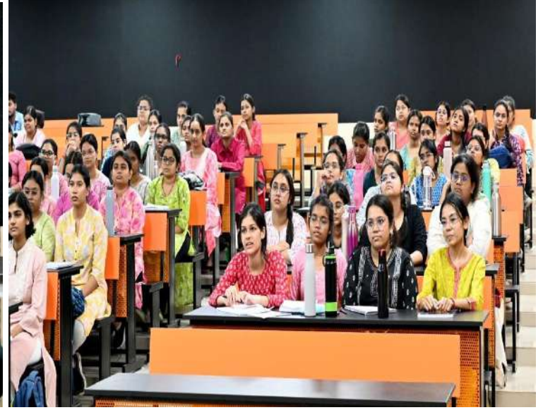
MBBS 2024 – 2025 BATCH