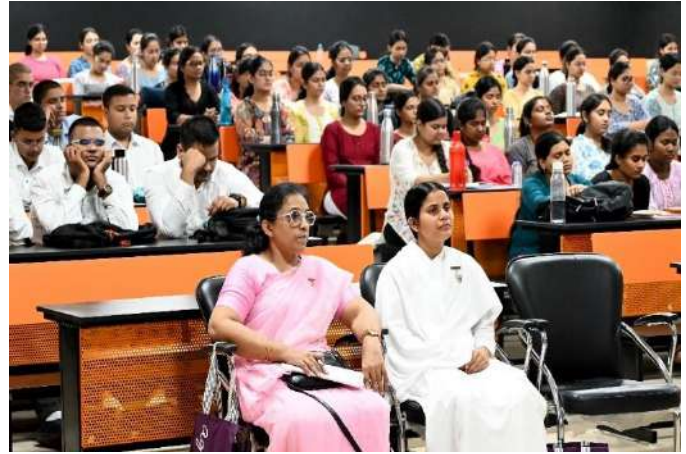
Bhrahma kumari –stress management