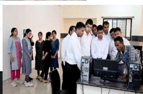
IMPORTANCE OF POSTURE EXERCISE IN MEDICAL PRACTICE - DOCUMENTATION – GOOGLE SEARCH