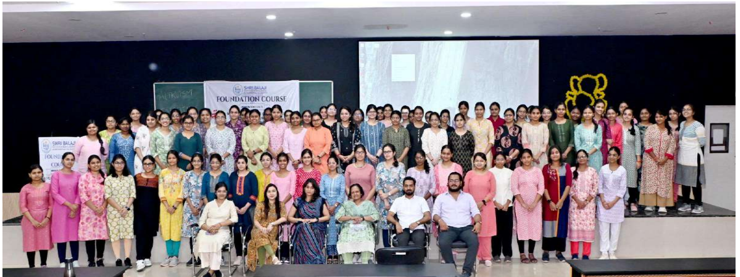
Team of foundation course