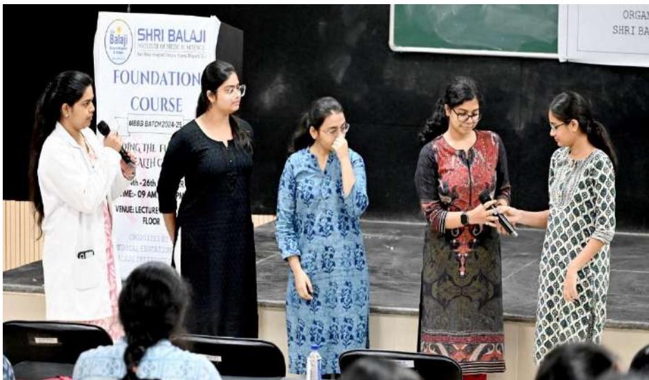
STUDENTS OF 2024 -2025 BATCH MBBS