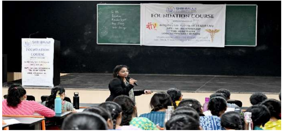
Dr shrawani health care systems in India primary, secondary, tertiary level care