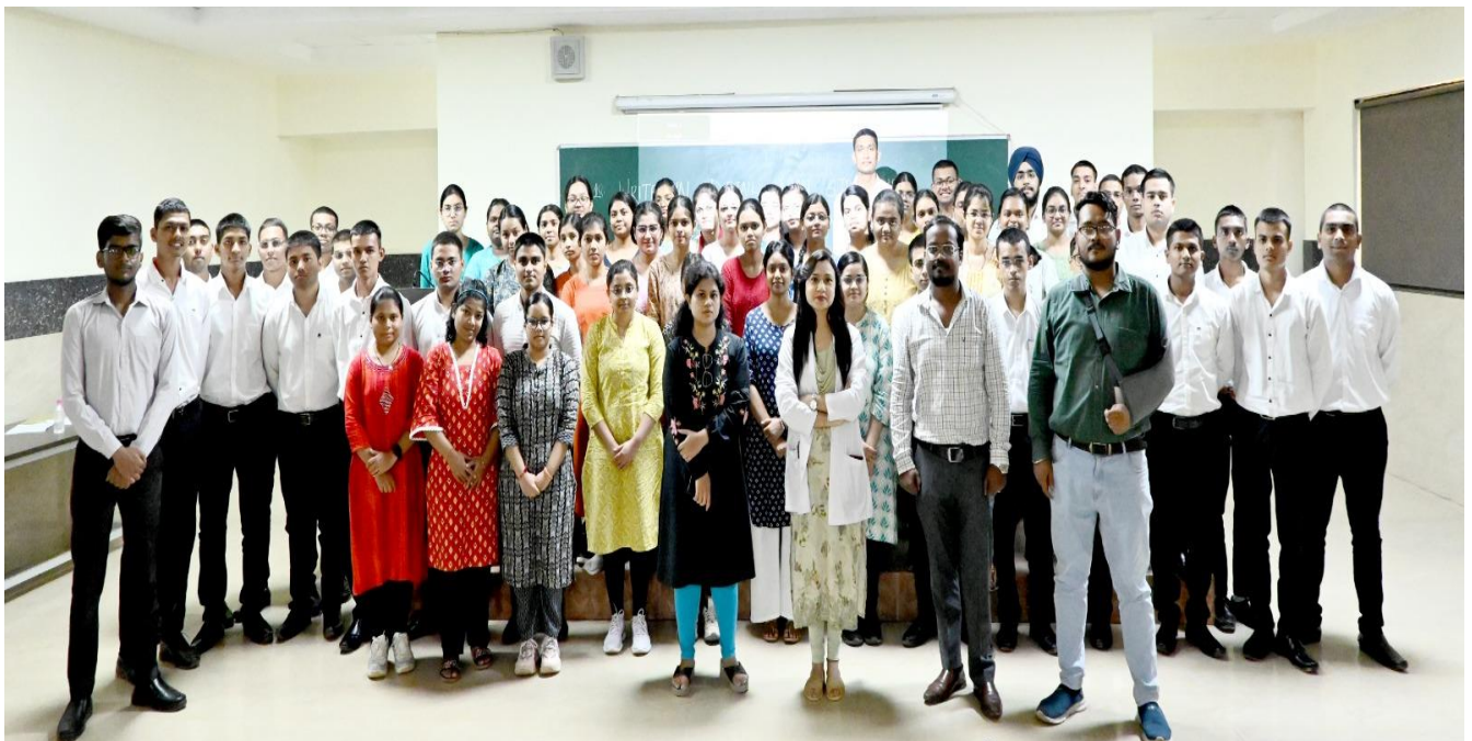
Feedback on Foundation course Biochemistry