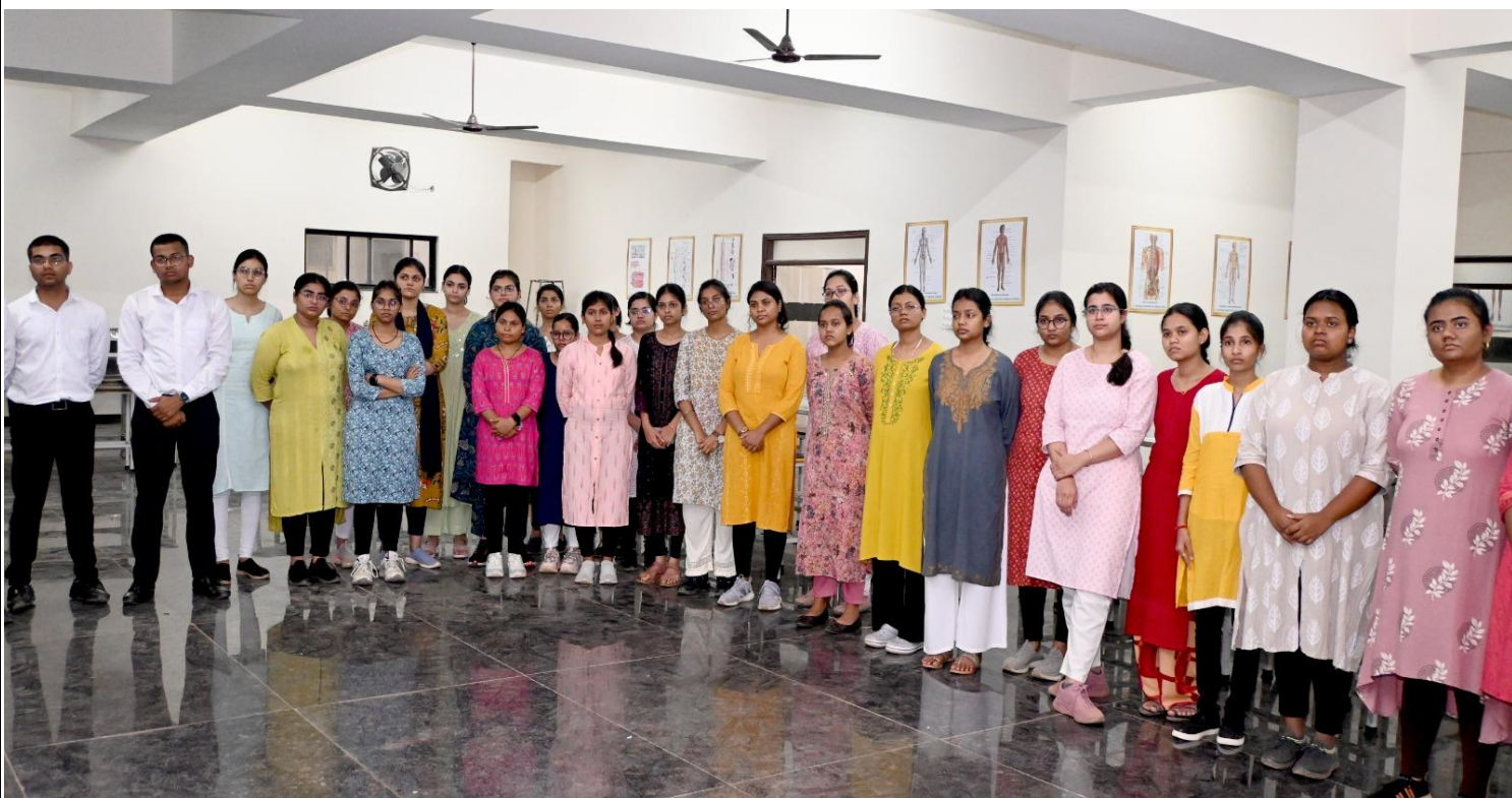
Visit to all museums